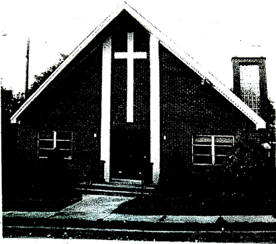
Fifth Avenue Presbyterian Church 301 Patton Avenue, Roanoke, VA 24016